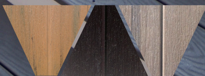
XF2 SIDING COLORS