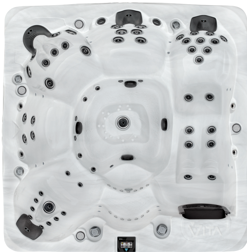
Specifications and styling subject to change. Shown with simulated AquaGlo accents and optional stereo.